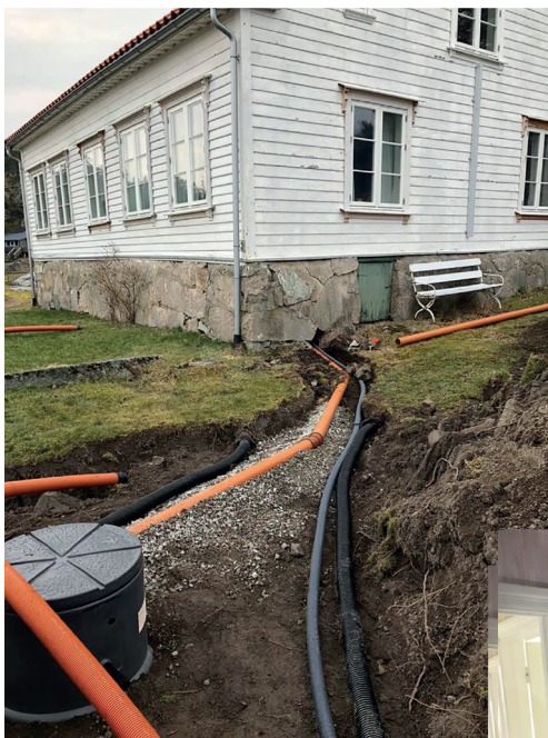
Access to public water and sewer